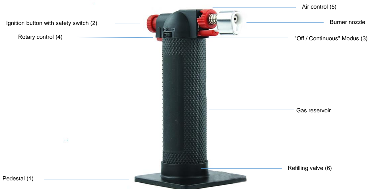
Figure 1: SurAChem® VG 02 surface pretreatment device